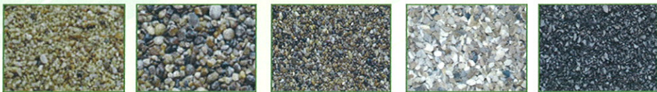
AUTUMN GOLD BRITTANY BRONZE GOLDEN PEA CORN FLINT TRUGRIP 68