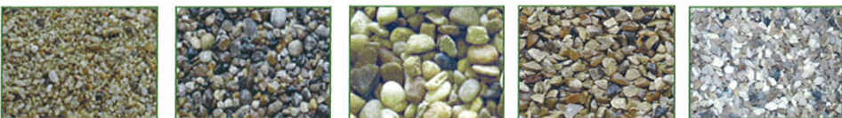
AUTUMN GOLD BRITTANY BRONZE RHINE GOLD YELLOW CORN FLINT