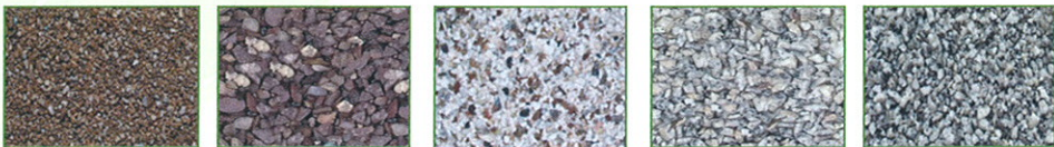
RED STAFFORDSHIRE PINK ROSE PINK SILVER GREY SILVER